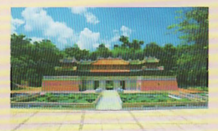
Ngo Môn gate Hue model

Formerly, Ngo Môn Gate was a place usually to take place important ceremonies under the Nguyễn Dynasty as Ban Sốc ceremony (grant a new calendar), Truyển Lô (pronounce name of new graduate doctors)...Miniature Ngo Môn Gate model in the tunnels of Cu Chi has scale equal to 1/4 of real one, it's started work on dated May 24<sup>th</sup> 2008 and finished on dated December 19<sup>th</sup> 2009.