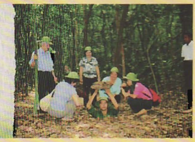
Sight-see the secret basement cover

Situated within Cu Chi Battlefield underground tunnel system, Ben Duoc underground tunnel complex was Saigon – Gia Dinh Regional Party headquarters and Military Command, has been classified as national – level Relic under Decision No. 54/VHQD on 29/04/1979. This is an unique project of architecture, as an underground system of tunnel deeply located in the ground bed with