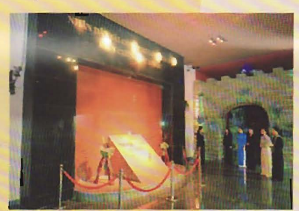
Visitors see Basement of Ben Duoc Temple

Basement is the place to exhibit the rough sand models, pictures, sculptures, which illustrate the typical revolution campaigns, exampled characters in the resilient undaunted fight of Saigon, Cho Lon, Gia Dinh people. The basement has 9 spaces, each illustrates a specific period of the over-100 year history against French, American invaders.