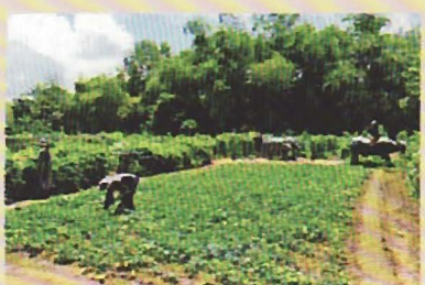
Productive views in liberated area

The work reappearing liberated area is a place to reappear stages of history from 1960-1975 where express condition of life and struggle of Cu Chi People before and in anti-American resistance war. Zone is divided into areas as liberated area, conflicting area, enemy-occupied area (strategic hamlets)...it expresses village scene of Cu Chi before war lively with luxuriant tree-fruit, bearing heavy fruit in four season; scene of it was destroyed by American bomb,