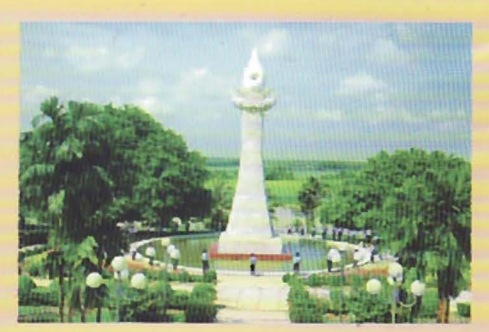
National spirit symbo

composite material in stone and copper such as designs on the column-bases, dragons, calligraphic, cranes...in aiming to bear the permanence, as well as to add more lists of the martyr's names carved on the stone epitaph. The Temple's basement, invested for building to exhibit the represented events with a topic "Saigon-Gia Dinh people staunch and dauntless" in anti-French and anti-American resistances with statues, images, sand-modules, prototypes combined with sound and light effects, will be inaugurated and opened for visiting by late 2008. The exhibited items in the Tower and the walkway connecting the basement over the Tower being invested for construction and will be early commissioned for serviced of tourists' visiting.