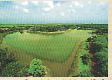
Three-region-forest and imitation pool of East Sea

Valuable wooden forest in three regions North – Middle – South is planted as S letter with area of about 4,6 ha that it's enclosed by a lake at two sides for imitating East Sea and West Sea with area of 6,8 ha. On the area planting valuable wooden as its region are built miniature three specific models: One-Pillar Pagoda (Hanoi), Ngo Môn Gate (Hue), and Nhà Rồng Harbor (HCMC). This work shall help educating love of country and nature, learning